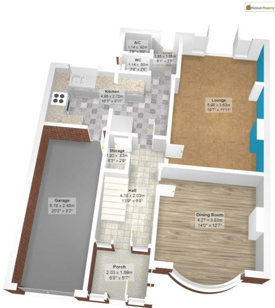
All measurements are approximate and for display purposes only