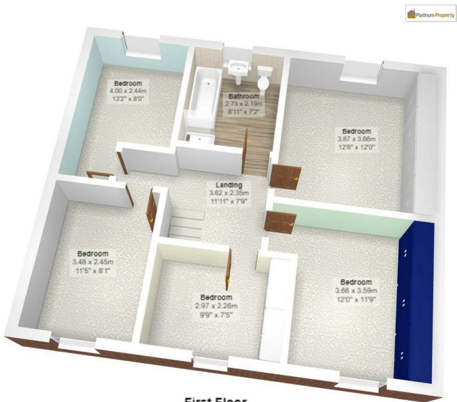
All measurements are approximate and for display purposes only